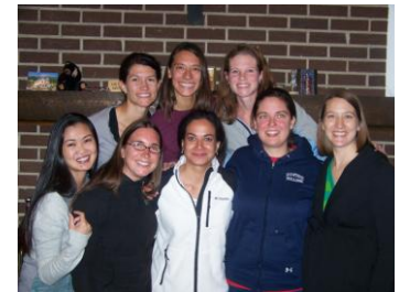
Year 6 10-year reunion

Stone House at Mother Cabrini Shrine Friday evening, January 28 th starting with dinner till Saturday evening, January 29 th , ending with liturgy