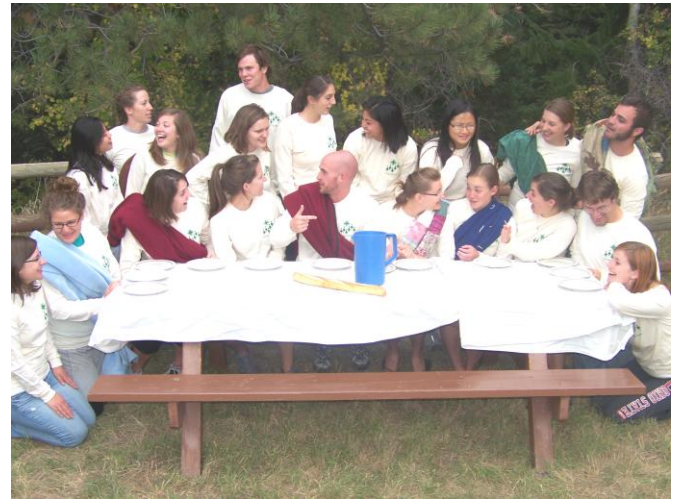
Year 16 at our Fall Retreat