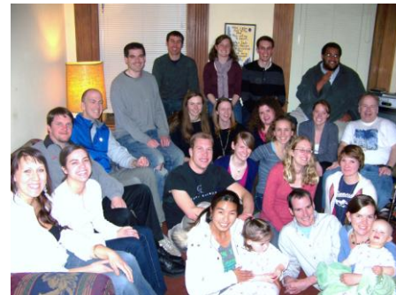
Alumni Reunion 2010

This retreat replaces our annual conference for this year. Please contact us for more details.