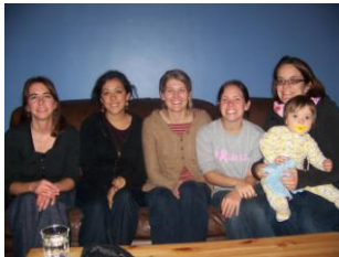
Alumni Gathering in Minnesota